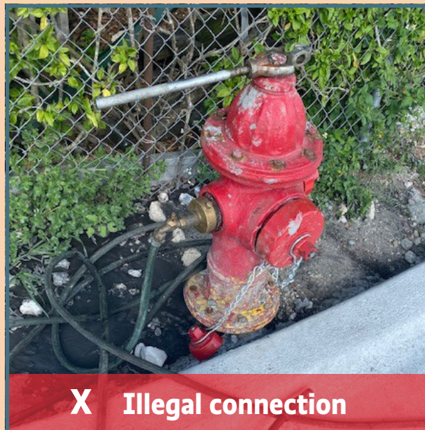
No backflow prevention. If spotted, please report this activity immediately.